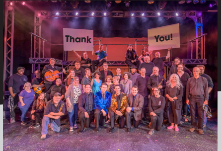
Cast of Jersey Boys 2024-2025 Season.